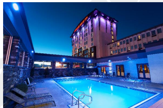
Pictures from left to right: Premium Two Queen guest room, Ballroom space, Peanuts Public House, year-round heated outdoor pool.